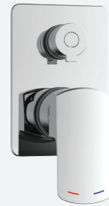
Chrome | QVDSMC