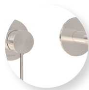
Brushed Nickel LBFBN