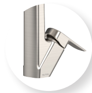
Brushed Nickel AXSMBN