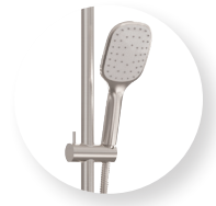
Brushed Nickel ADS-SRSCBN (7)743088